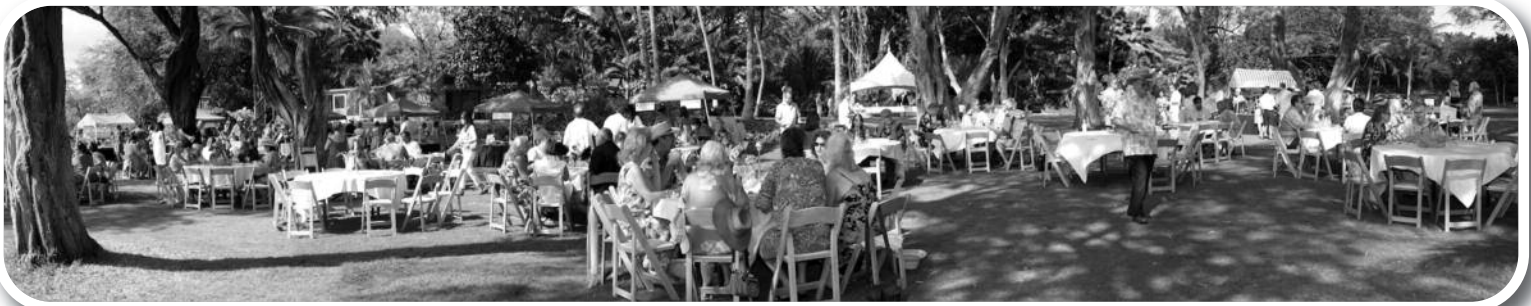
“Chefs on the Beach” Event Raises Funds for Maui Charities

The Rotary Club of Maui held its second annual “Chefs on the Beach” fund-raising event on May 30, 2009 as a way to support several worthy Maui non-profits who work to improve the lives and well being of our greater Maui’ohana.