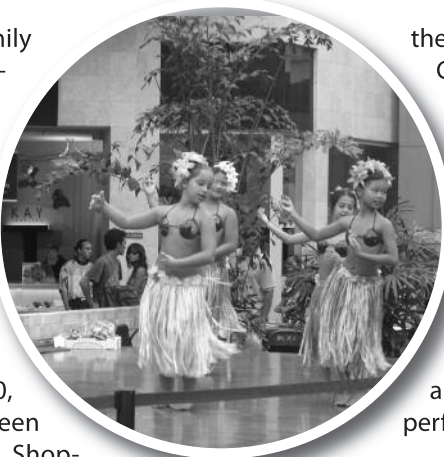
Keiki entertainers at the 14th Annual Stand for Children Rally in September

Maui Family Support Services sponsored the 14th Annual Stand for Children Rally and Celebration on September 20, 2009 at Queen Kaahumanu Shopping Center in Kahului.