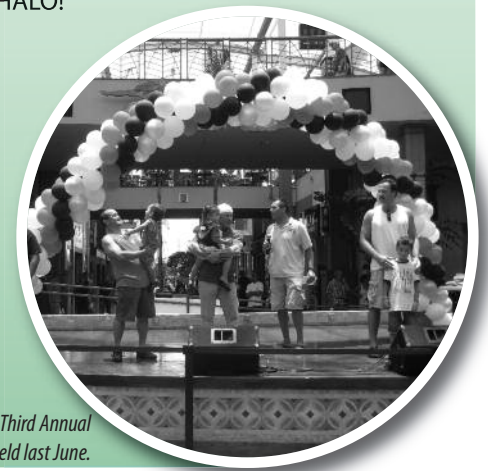
Dads on Display at the Third Annual Celebration of Fathers event held last June.